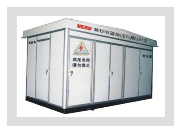
Aluminum alloy covering