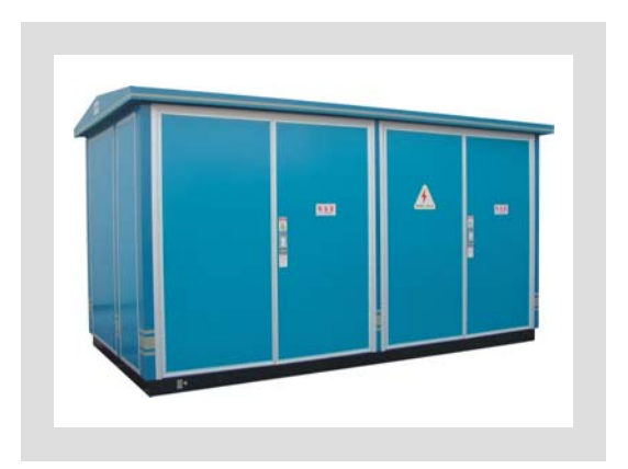
Colored steel plate covering