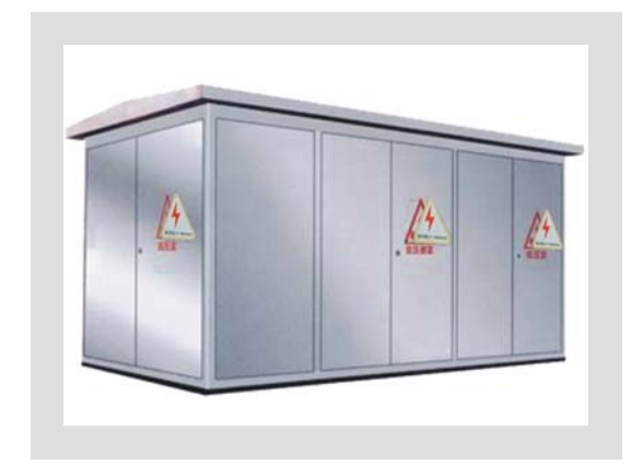
Stainless steel covering