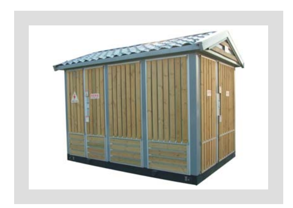
Anti-corrosion wooden covering

It adopt the S9(11)-M fully sealing transformer and SC9 solid-cast transformer, the capacity is: 30, 50, 80, 100, 125, 160, 200, 250, 315, 400, 500, 630, 800, 1000, 1250, 1600kVA.