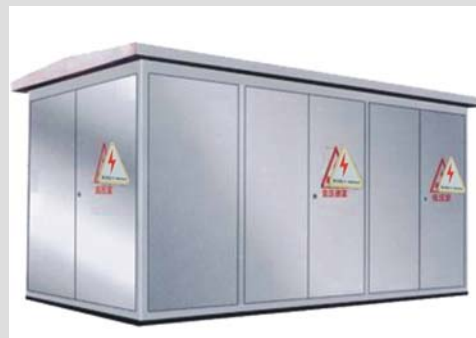
Stainless steel covering