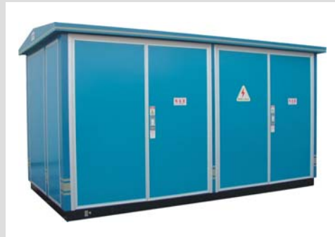
Colored steel plate covering