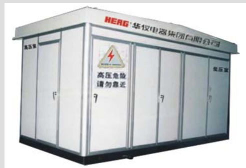
Aluminum alloy covering