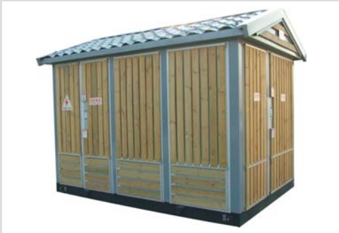
Anti-corrosion wooden covering

It adopt the S9(11)-M fully sealing transformer and SC9 solid-cast transformer, the capacity is: 30, 50, 80, 100, 125, 160, 200, 250, 315, 400, 500, 630, 800, 1000, 1250, 1600kVA.